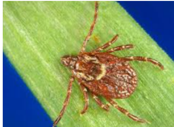
(American Dog Tick)