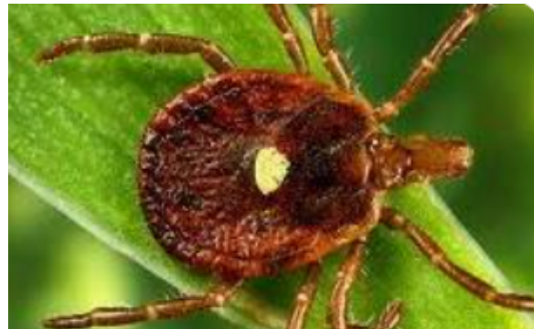
(Lone Star Tick)

(See next page for photos on ticks on skin)